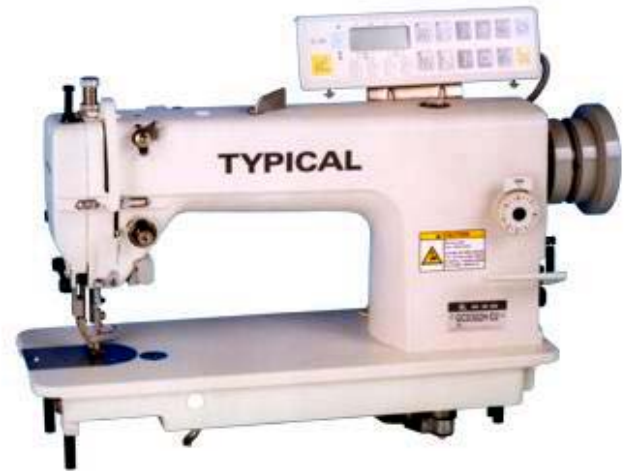
AC Servo Motor